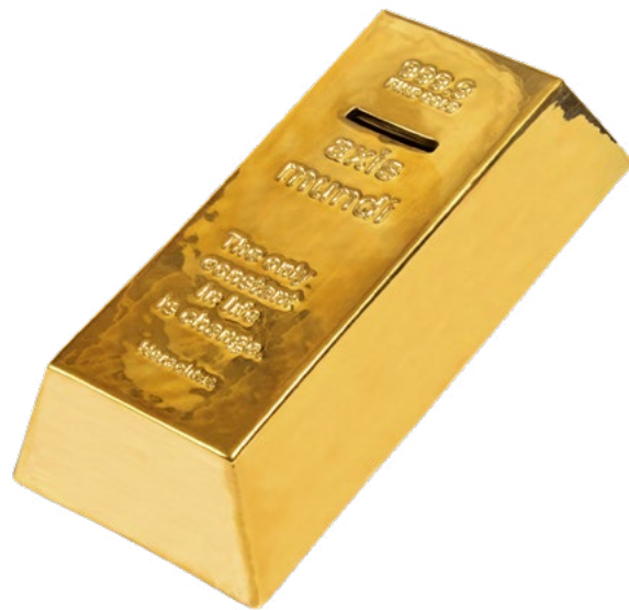
0007669.604 Gold Bullion Coin Bank