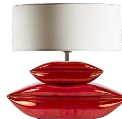
0008097.344 Table Lamp cm. 20 X 43 X 42