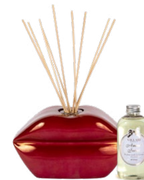
0008093.344 Home Fragrance cm. 10 X 10 X 18