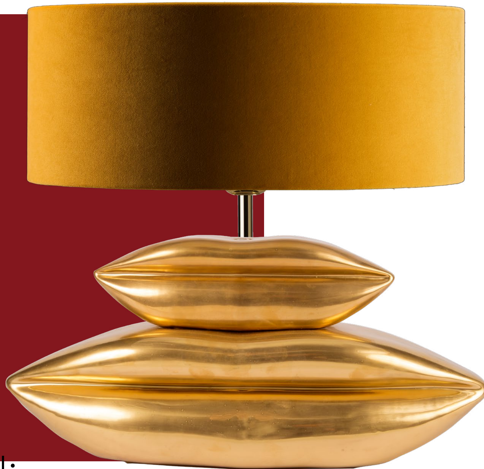
L'idea del Bacio