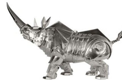
0005320.606 King Kong Rhino - Platinum limited edition: 88 pcs cm. 44 h x 65 l x 20 w