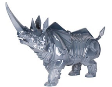
0005320.343 King Kong Rhino - Avio limited edition: 88 pcs cm. 44 h x 65 l x 20 w