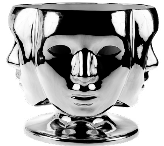
0008138.606 Nobody Ltd. edition 100pcs