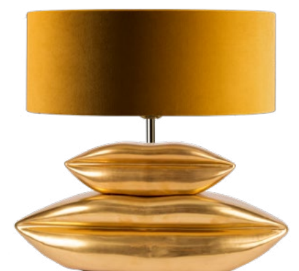
0008097.604 Table Lamp cm. 20 X 43 X 42