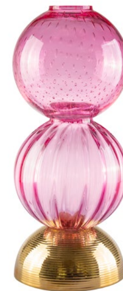
8208153.604 Double Graal cm. 16 X 35 X 16