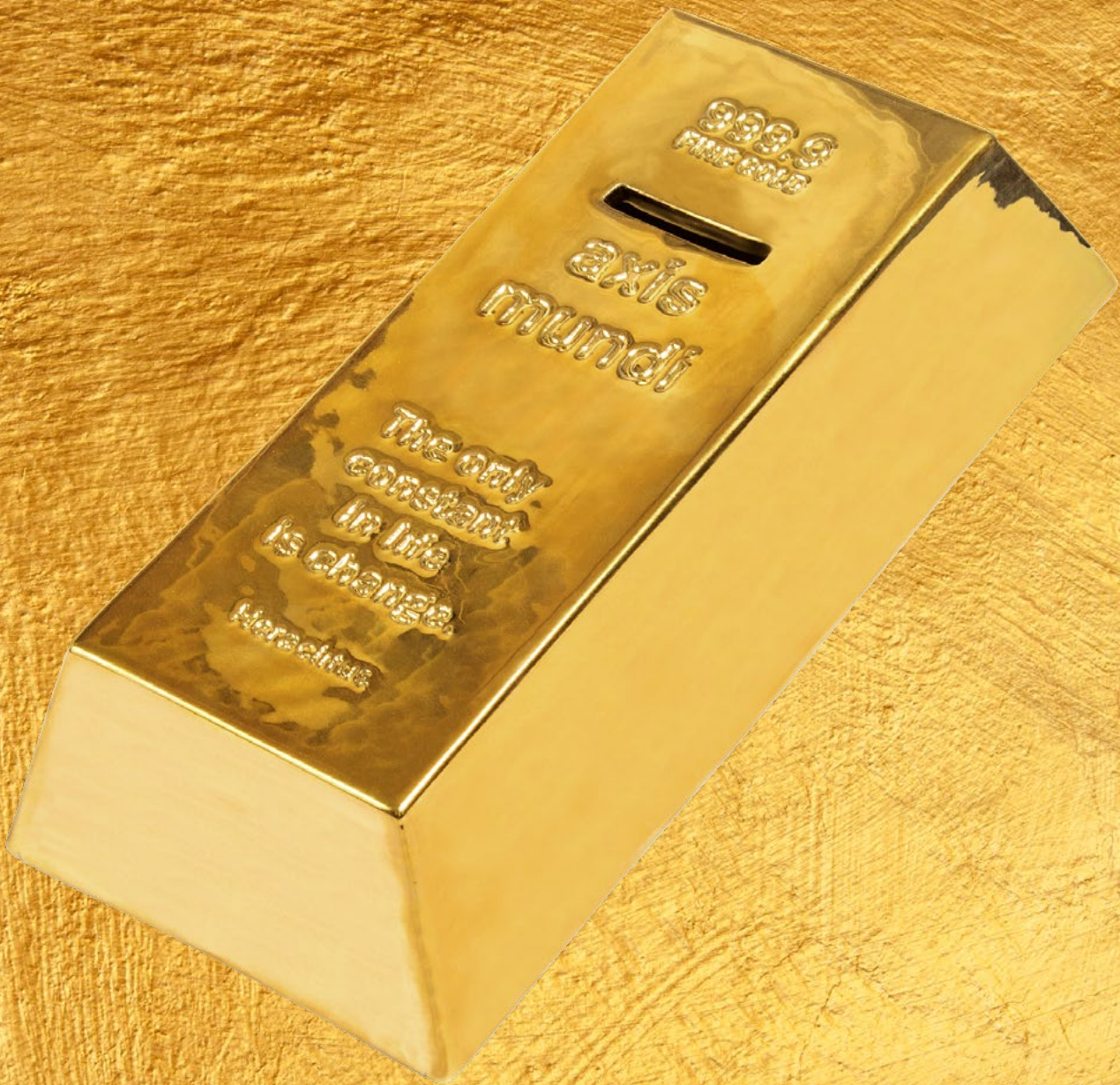
Gold bullion coin bank