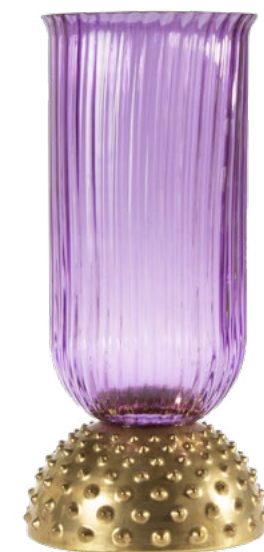
8808151.604 Crazy Graal cm. 15 X 31 X 15