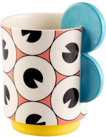
0008132.500 Eyeballs Mug cm. 8 X 12 X 10