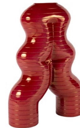
0008101.344 Small Peral Red cm. 7 x 25 x 18