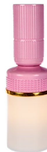
0008139.341 Talía Rechargeable