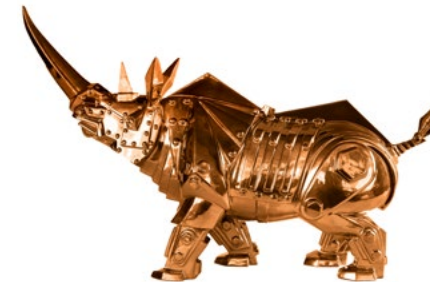
0005320.554 King Kong Rhino - Bronze limited edition: 88 pcs cm. 44 h x 65 l x 20 w