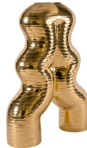
0008102.604 Large Shiny Gold cm. 10 x 37 x 25