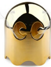
0008098.602 Mini Tox cm. 8 x 10 x 8