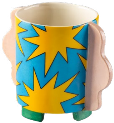
0008131.500 Boom Mug cm. 8 X 10 X 14

Editorial clients: The New Yorker, The New York Times, New York Mag, Reader's Digest, NBC, Die Zeit, McSweeney's, Le Monde, La Parisienne, Les Echos Weekend, Monocle, Mr. Porter, Soho House, BBC Science, *Wallpaper, Frame, Die Zeit, Der Spiegel, Nido Stern, Feltrinelli, Esquire, Vanity Fair, Vogue, Rolling Stone, Icon, Icon Design, Mousse, Vice, L'Officiel Hommes, Rivista Studio, IL Magazine