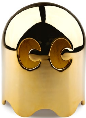
0008159.604 Minone cm. 28 x 35 x 28