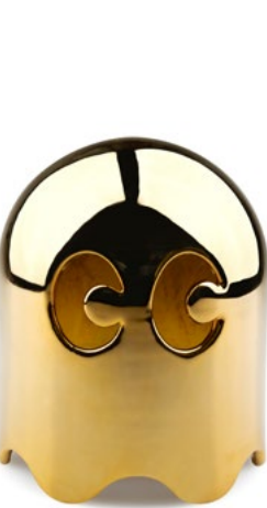
0007976.604 Mino cm. 15 x 20 x 15

Born in Cremona in 1960, he attended the Politecnico di Milano Architecture Faculty and graduated in 1986, after studying on the courses taught by Achille Castiglioni and Marco Zanuso. In 1991 he opened his own Studio in Milan. He works in the areas of product design, interior design, art direction and graphics. He has been Art Director at Kartell since 1991 and has held this position for various other companies including Flos, De Padova, Foscari, Moroso, Society (Limonta) and Emme-mobili.