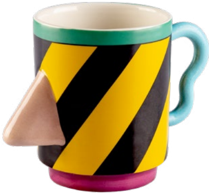
0008133.500 Nose Mug cm. 8 X 10 X 14