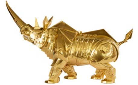
0005320.602 King Kong Rhino - Gold limited edition: 88 pcs cm. 44 h x 65 l x 20 w