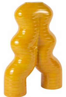
0008101.218 Small Imperial Yellow cm. 7 x 25 x 18