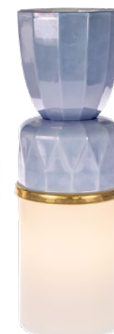
0008140.343 Agliaia Rechargeable