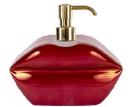
0008096.344 Soap Dispenser cm. 10 X 14 X 18