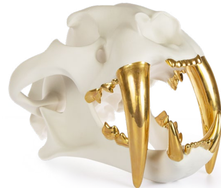
0008135.709 Saber Tiger cm. 40 x 29 x 29

Nowadays, seeking the aesthetic component and the concept, he gets his ideas from the same sources he created when playing as a child, daydreaming with what is usually around him every day.