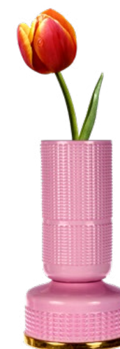
0008226.341 Talía Vase