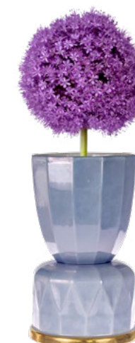
0008224.343 Agliaia Vase