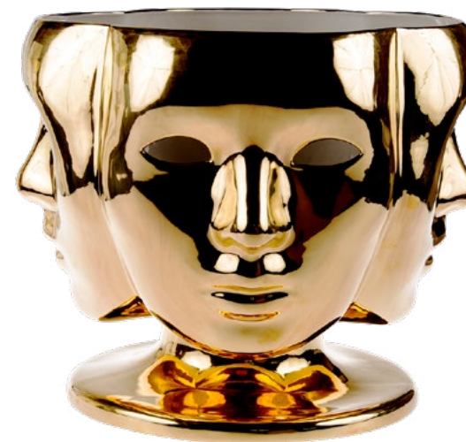
0008138.604 Nobody Ltd. edition 100pcs