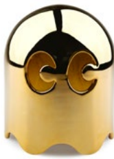
0008099.602 Mini Light cm. 8 x 10 x 8