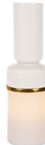
0008139.402 Talía Rechargeable