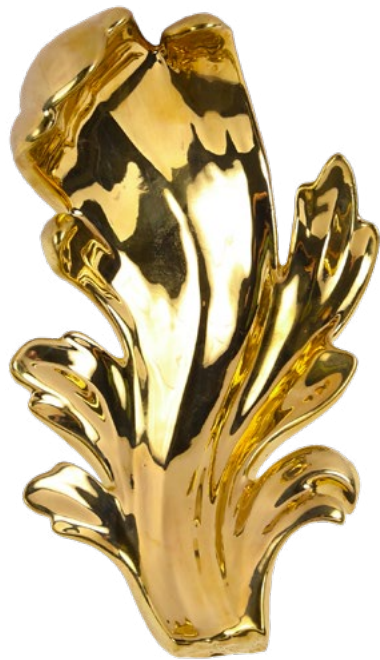
0008136.604 Acanth-Hang cm. 14 x 10 x 22