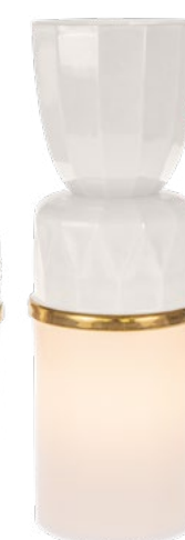
0008140.402 Agliaia Rechargeable