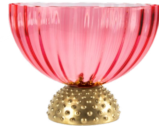
8308152.604 Gran Graal cm. 30 X 23 X 30