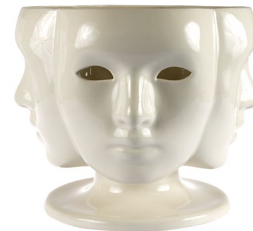
0008138.102 Nobody Ltd. edition 100pcs