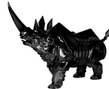
0005320.277 King Kong Rhino - Black limited edition: 88 pcs cm. 44 h x 65 l x 20 w