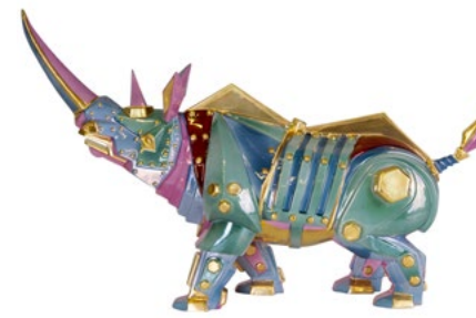
0005320.665 King Kong Rhino - Multicolor limited edition: 88 pcs cm. 44 h x 65 l x 20 w